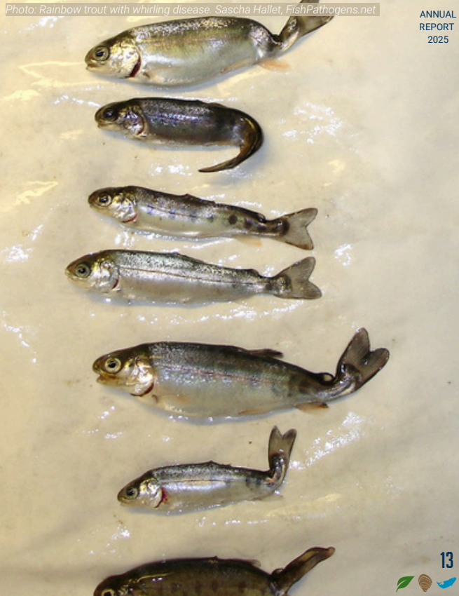
Photo: Rainbow trout with whirling disease.

Throughout the year, Whirling Disease education was integrated into community events, outreach to industry partners, and recreational boater engagement. CSISS shared provincial resources on prevention, Clean, Drain, Dry practices, Pull the Plug regulation, decontamination procedures, and expanded public awareness through social media, newsletters, and updated website materials.