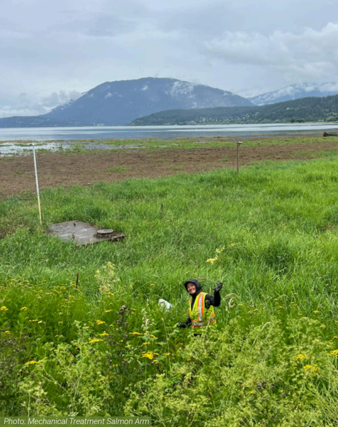
Photo: Mechanical Treatment Salmon Arm

Mechanical treatment was completed by CSISS staff, contractors, and volunteers. CSISS coordinated spot application of chemical treatment for regional priority invasive plants with a certified pesticide applicator, and staff conducted herbicide monitoring to ensure successful treatment at these sites. Do not mow signs were installed along roadways in the Shuswap and Revelstoke region to prevent the spread of knotweed species . Landowner outreach was completed when regional priority species were found on private properties.