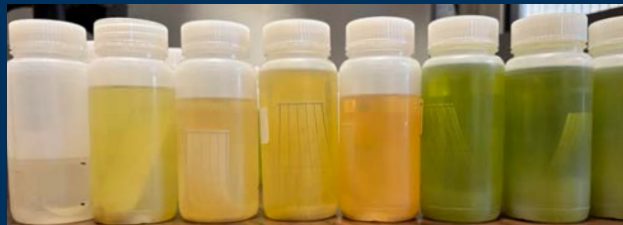
Photo: A selection of water samples ready to be sent to the laboratory