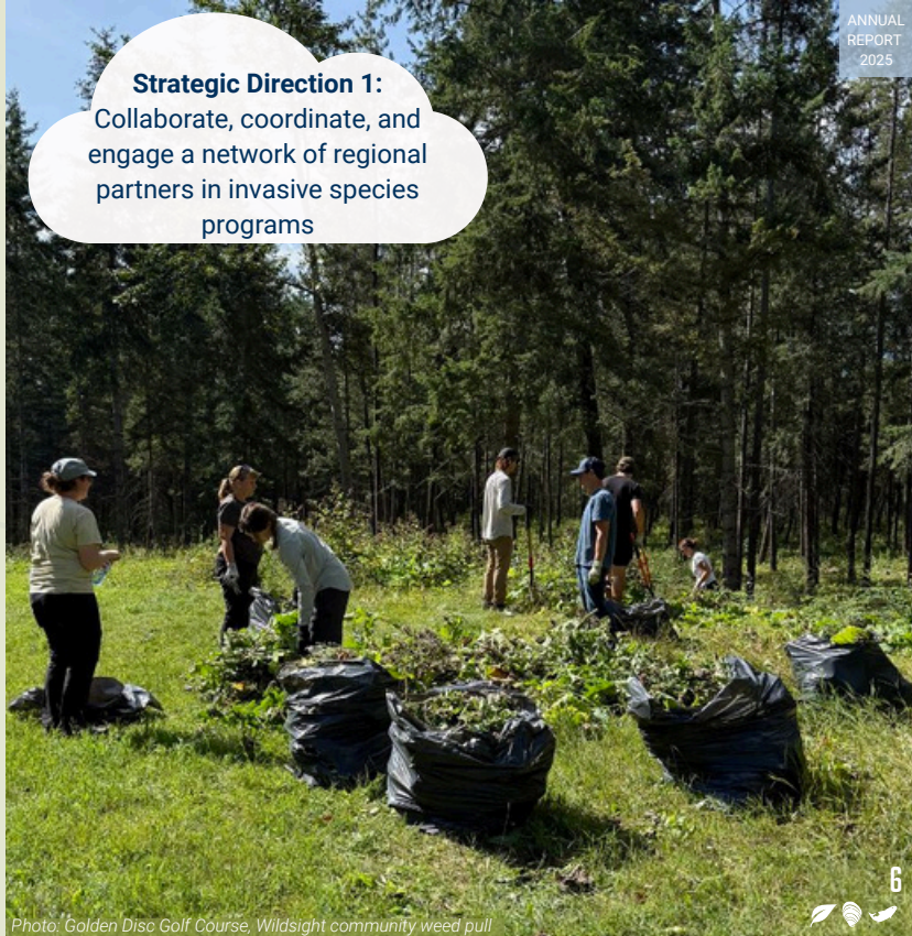
Photo: Golden Disc Golf Course, Wildsight community weed pull

Strategic Direction 1: Collaborate, coordinate, and engage a network of regional partners in invasive species programs