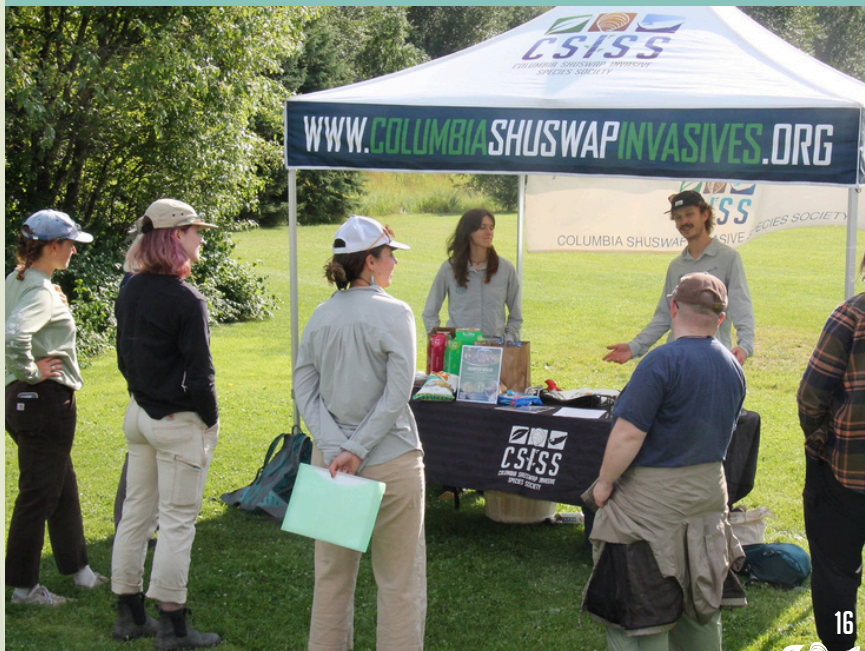
Photo: Revelstoke Illecillewaet Greenbelt Community Speed Weed Event, showing CSISS staff and volunteers