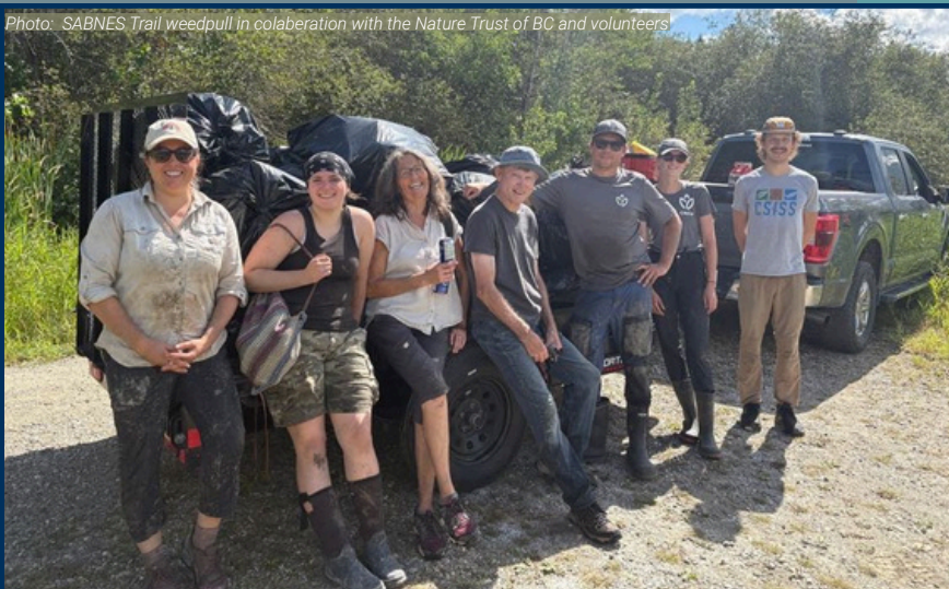
Photo: SABNES Trail weedpull in collaboration with the Nature Trust of BC and volunteers

Hands on events like community weed pulls provide meaningful opportunities for individuals and youth to engage in environmental stewardship and feel empowered to act locally. Participants gain valuable education about local invasive species, their impacts on wildlife and ecosystems, and how to prevent their spread through responsible recreation and stewardship practices.