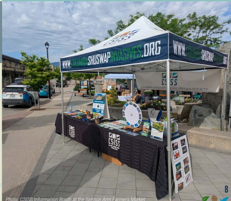
Photo: CSISS Information Booth at the Salmon Arm Farmers Market

CSISS delivers events at key locations such as Salmon Arm, Sicamous, Revelstoke and Golden, while also prioritizing outreach to all rural communities throughout the CSRD. CSISS hosts and attends events at Provincial and National Parks, regional trail networks, Indigenous friendship centers and community spaces such as libraries, museums and community halls.