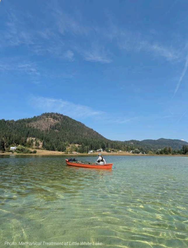
Photo: Mechanical Treatment at Little White Lake

Columbia Shuswap Invasive Species Society