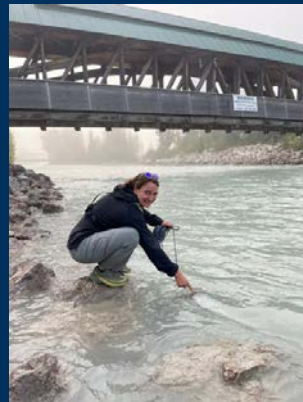
Photos: Collecting Water Samples