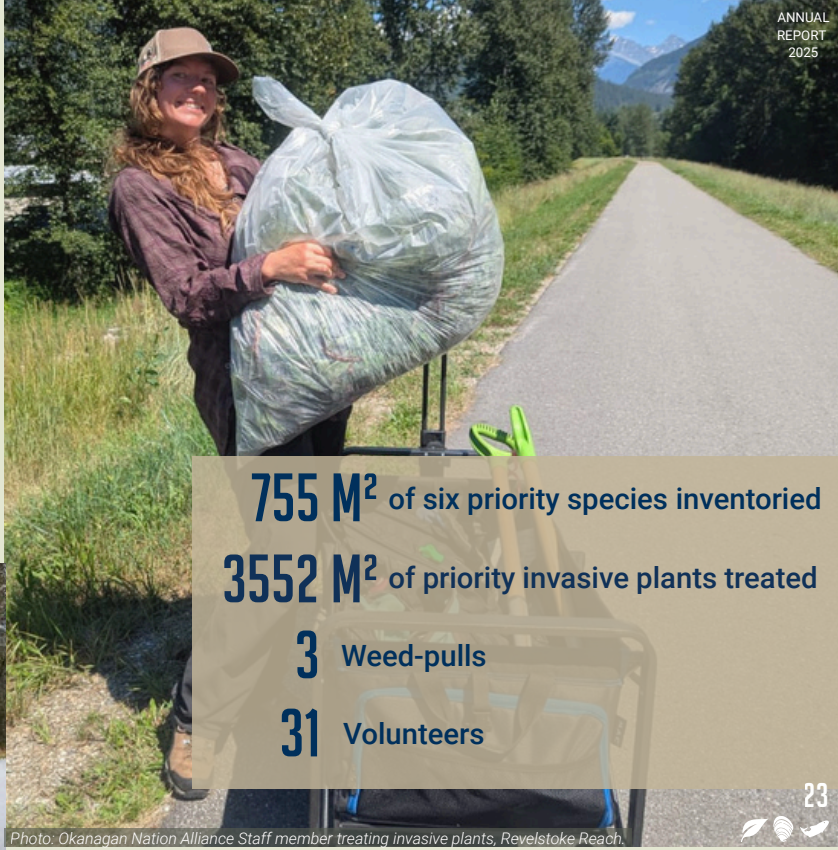
Photo: Okanagan Nation Alliance Staff member treating invasive plants, Revelstoke Reach.

755 M 2 of six priority species inventoried 3552 M 2 of priority invasive plants treated 3 Weed-pulls 31 Volunteers