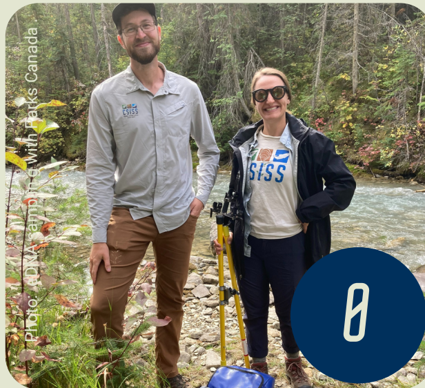
Photo: DNA sampling with Parks Canada