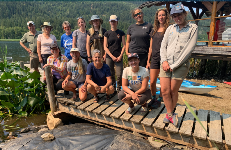
Benthic Barrier Installation Workshop: a novel treatment method for yellow flag iris