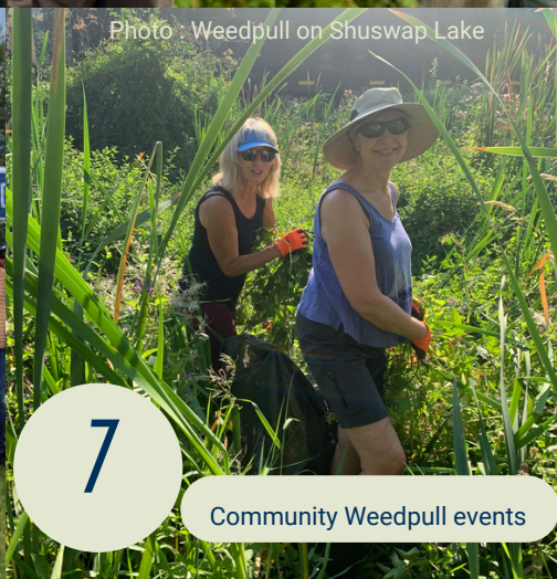
Photo: Weedpull on Shuswap Lake

Presentations, Workshop and Training Events