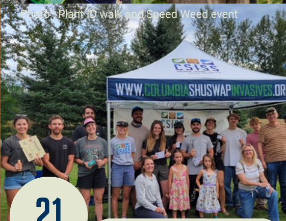
Photo: Plant ID walk and Speed Weed event