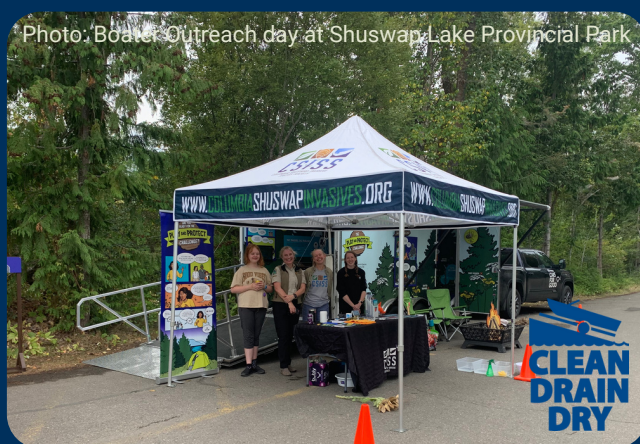
Photo: Boat Outreach day at Shuswap Lake Provincial Park

Attended 9 Aquatic Invasive Species events, visited 38 marinas/ campgrounds with 'Clean Drain Dry' messaging