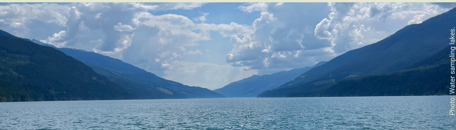
Photo: Water sampling lakes.