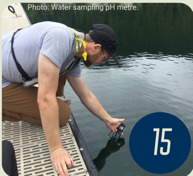
Photo: Water sampling pH metre.

Photo: Sampling day with Shuswap Watershed Council.