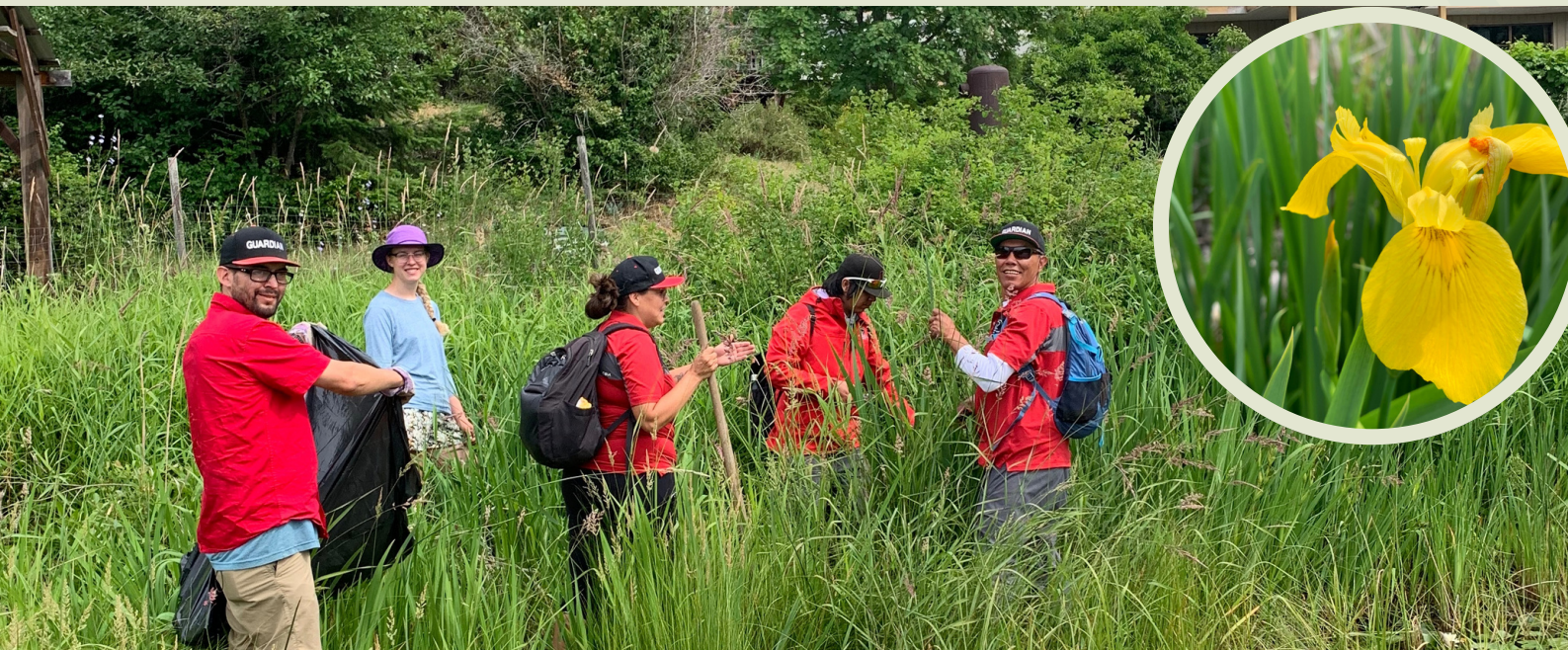
Photo: Little White Lake Yellow Flag Iris Weedpull. CSISS staff, Invasive Species Council of BC staff, Skwllāx Guardian Program, and local volunteers deadheaded yellow flag iris seed pods and flowers. Top Right Insert: Yellow Flag Iris flower head.

CSISS completed detailed site inventory and post-treatment monitoring for invasive yellow flag iris in sites around the Shuswap, including: White Lake, Turner Creek, McGuire Lake, Gardom Lake and Little White Lake. The Shuswap Trail Alliance crews, mechanically treated all infestations of yellow flag iris at White Lake (highest priority) Turner Creek and McGuire Lake.