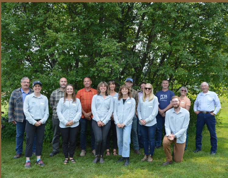
Photo: CSISS Board of Directors and Staff at 10th Anniversary event.