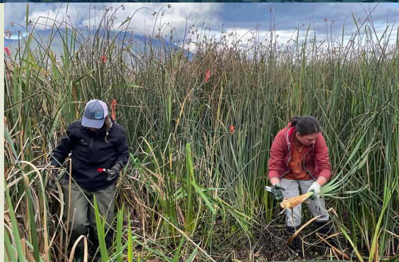
Salmon Arm Bay- trialing Benthic Barrier with Nature Trust of BC