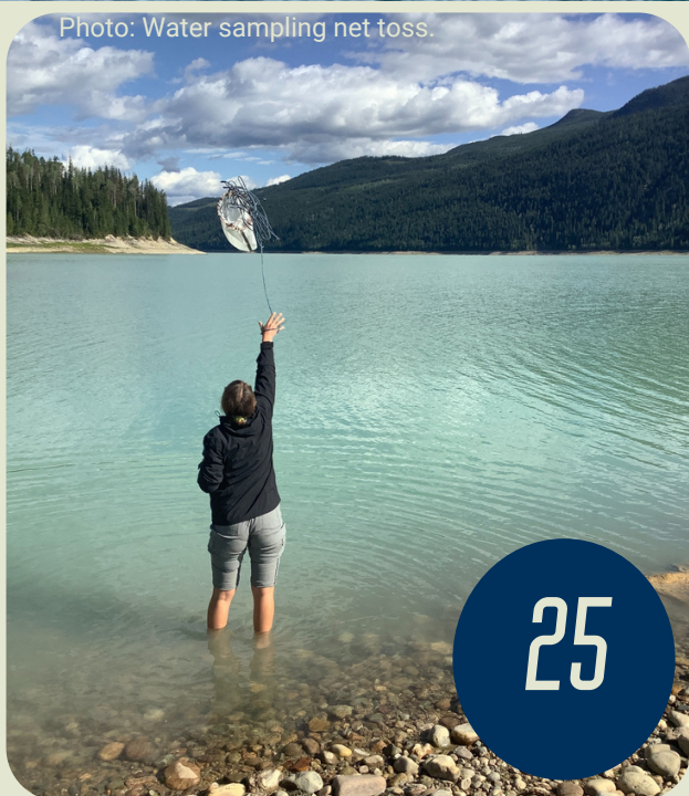
Photo: Water sampling net toss.