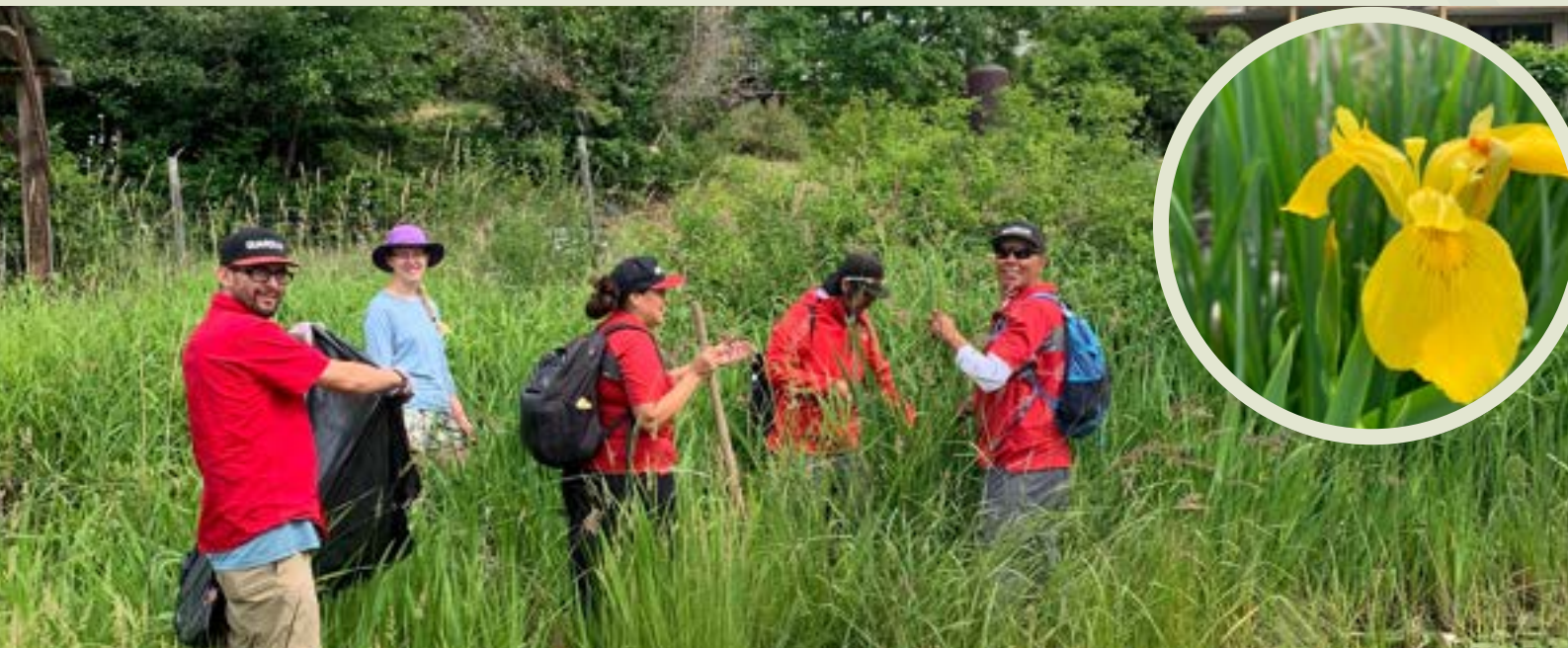
Photo: Little White Lake Yellow Flag Iris Weedpull. CSISS staff, Invasive Species Council of BC staff, Skwłāx Guardian Program, and local volunteers deadheaded yellow flag iris seed pods and flowers. Top Right Insert: Yellow Flag Iris flower head.

CSISS completed detailed site inventory and post-treatment monitoring for invasive yellow flag iris in sites around the Shuswap, including: White Lake, Turner Creek, McGuire Lake, Gardom Lake and Little White Lake. The Shuswap Trail Alliance crews, mechanically treated all infestations of yellow flag iris at White Lake (highest priority) Turner Creek and McGuire Lake.