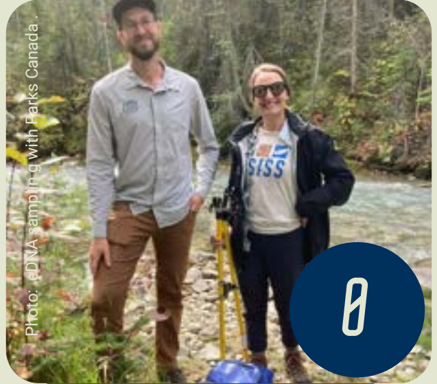
Photo: eDNA sampling with Parks Canada.