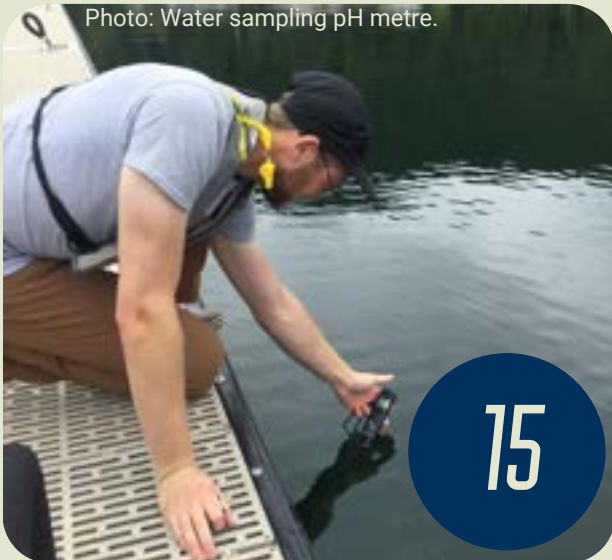
Photo: Water sampling pH metre.