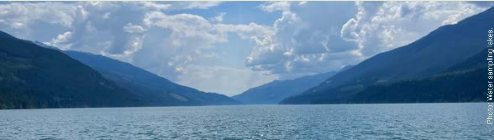
Photo: Water sampling lakes.