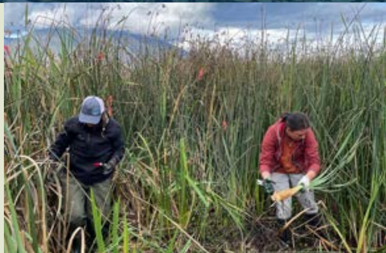
Salmon Arm Bay- trialing Benthic Barrier with Nature Trust of BC