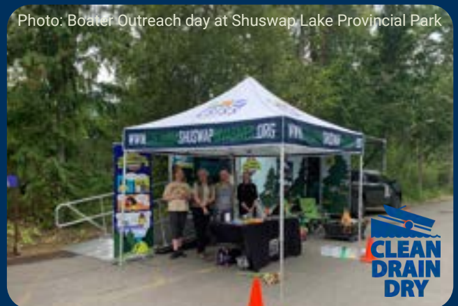
Photo: Boater Outreach day at Shuswap Lake Provincial Park