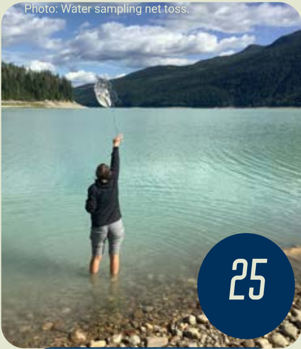
Photo: Water sampling net toss.