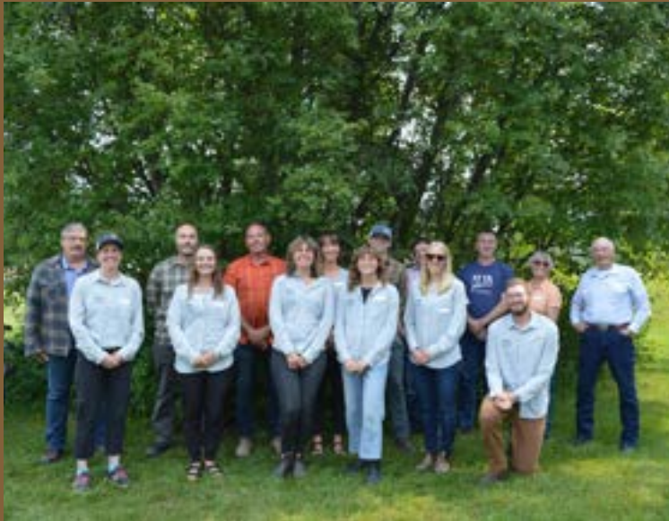
Photo: CSISS Board of Directors and Staff at 10th Anniversary event.