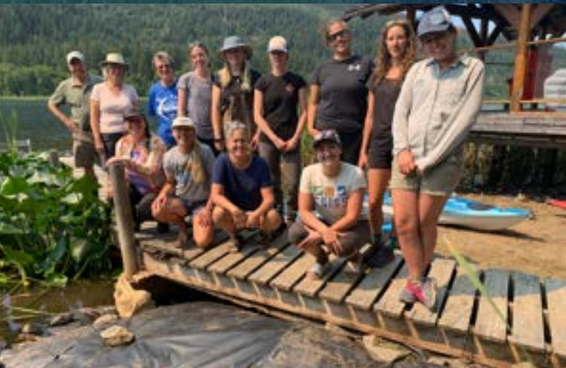
Benthic Barrier Installation Workshop: a novel treatment method for yellow flag iris