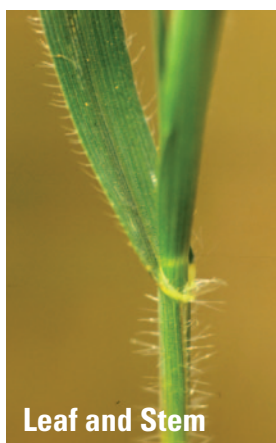
Leaf and Stem

Biological: The similarity between Jointed Goatgrass and wheat makes the likelihood of finding truly selective agents rather low. 8