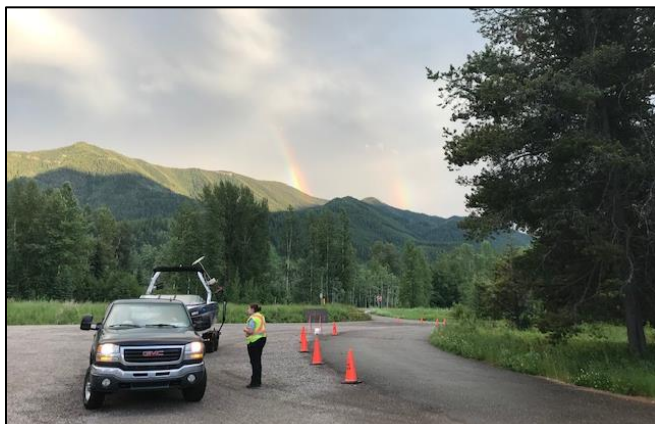
AIS inspector conducting COVID-19 screening at the Boundary border crossing (above) and (left) conducting watercraft inspection at the Olsen (Fernie) station on Hwy 3.