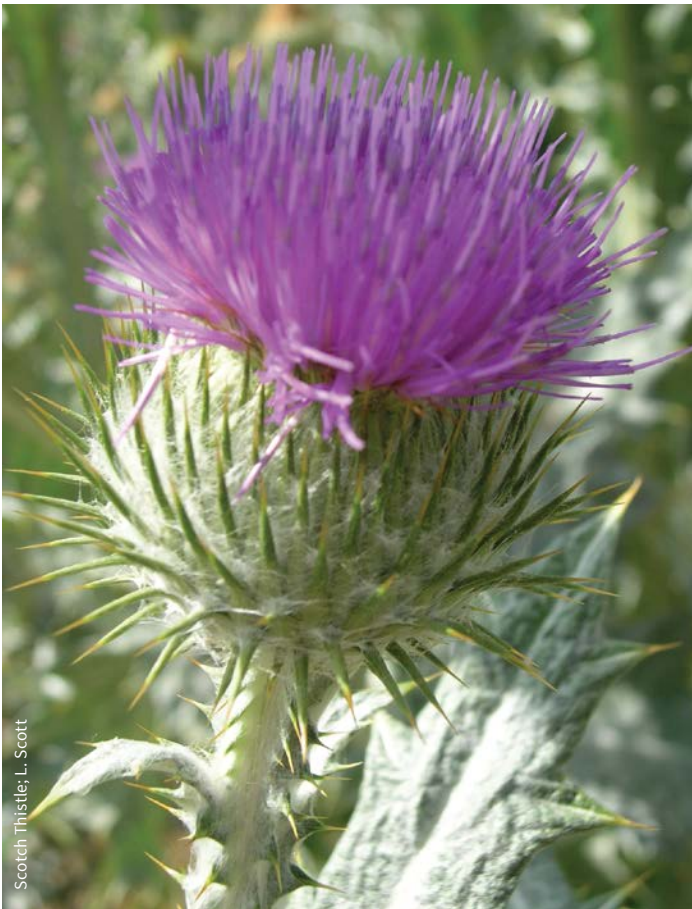
Scotch Thistle

SEEDS CAN REMAIN VIABLE IN SOIL FOR UP TO 39 years